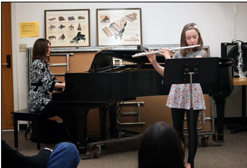
This aspiring young flautist placed her best flute forward in last years Rising Star Festival at Flute Fest.

Teachers, please encourage your students to sign up--after all, they're going to be at Flute Fest anyway! Comments will be mailed to you or you can pick them up in person after the awards ceremony. It was such a breath of fresh air last year to have someone else's perspective on my students, giving them reinforcement on the things we'd been spending time working on, new areas to consider, and honest compliments on what they were doing well. Applications will be due by March 15th. Further details can be found at umfaflutes.org .